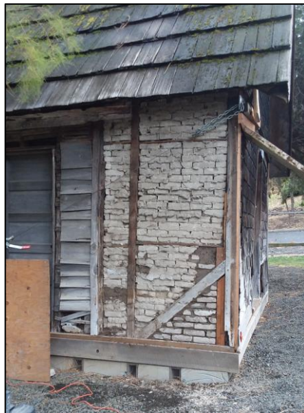
FIGURE 3. SW CORNER SHOWING CLAMP USED TO MOVE THE CORNER BRACE BACK INTO PLACE AND THE REPLACED BRICK INFILL PRIOR TO PUTTING ON THE PLYWOOD SHEATHING.