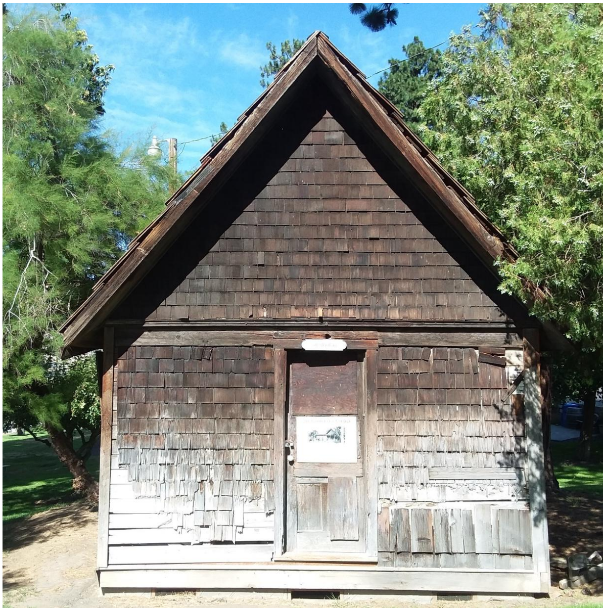
FIGURE 1. SOUTH SIDE OF GARDENER'S COTTAGE BEFORE THE DETERIORATED SHINGLES WERE REMOVED.

underlayment behind the cedar shingles is mostly clapboards as well, but here they are short sections installed butting up to one another in an upside down orientation. On the west side, which would have been the back of the building at its original location, it looks like scraps of clapboard and planks of various width were used to side the building. Perhaps they started siding the building on the Fort side, began running out of clapboard on the front, so spaced it out a little wider, and then used the scraps on the rest of the building? It also looks like the building was whitewashed several times, and that it might have been without siding for at least for a little while, as one of the coats of whitewash is on the bricks and framing behind the siding.