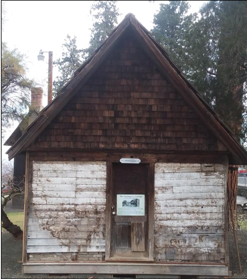
FIGURE 2. SHINGLES REMOVED FROM SOUTH WALL. SHOWING INVERTED CLAPBOARD SIDING OVER FRAMING AND BRICK INFILL.