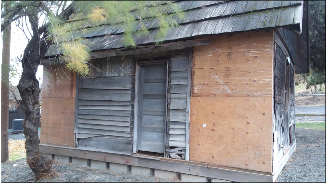
FIGURE 4. PLYWOOD SHEATHING IN PLACE.