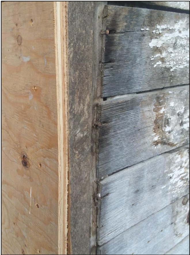
FIGURE 5. DETAIL VIEW OF SW CORNER SHOWING THE INVERTED CLAPBOARDS WITH NO OVERLAP!