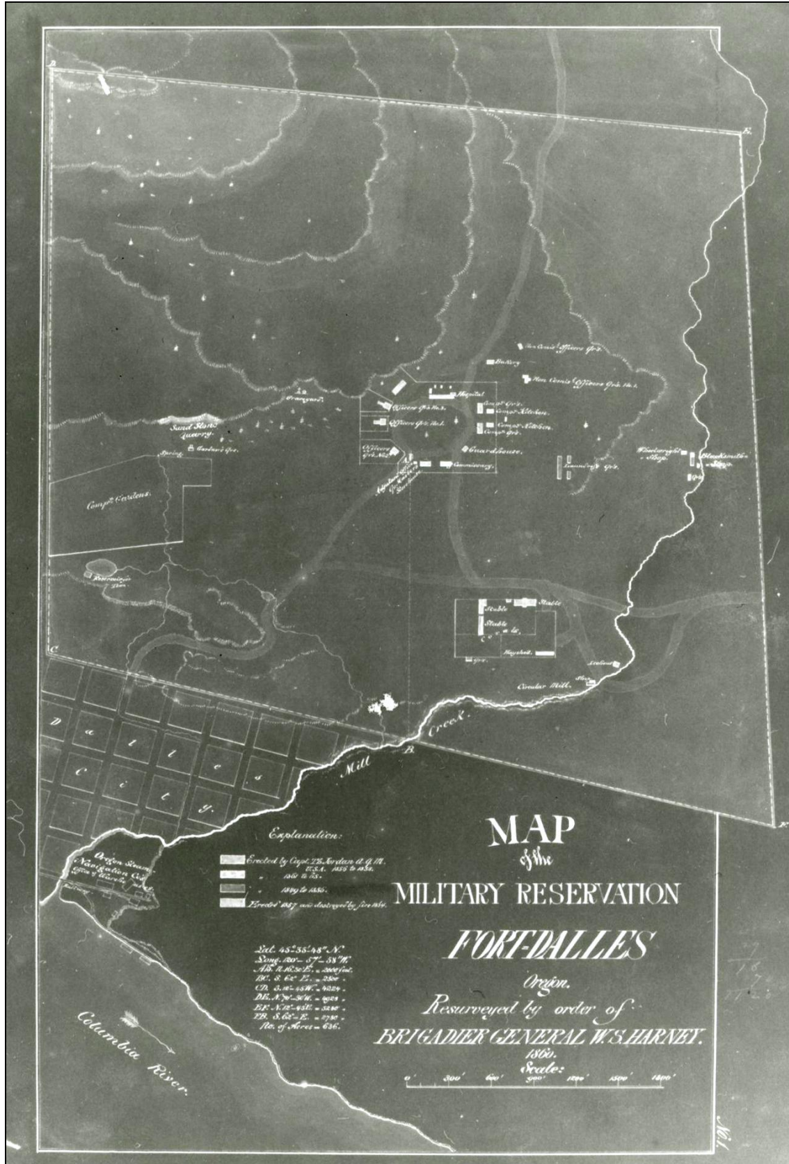
FIGURE 6. 1860 MAP OF FORT DALLES.